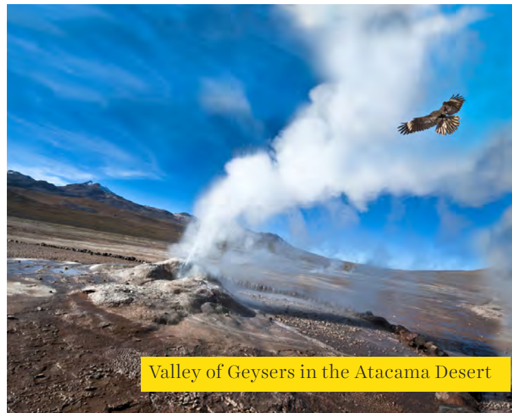
Valley of Geysers in the Atacama Desert