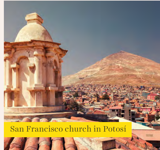
San Francisco church in Potosí