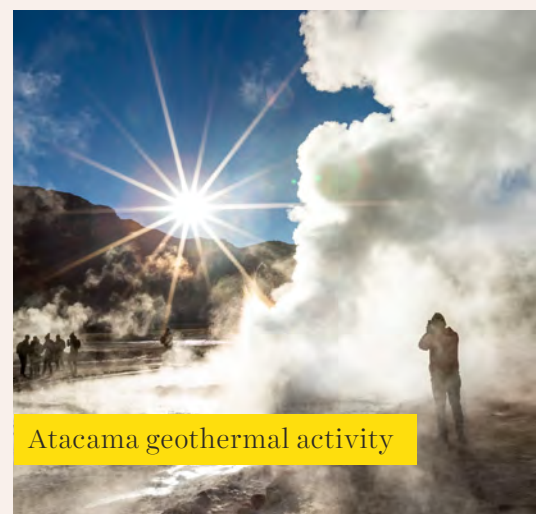
Atacama geothermal activity