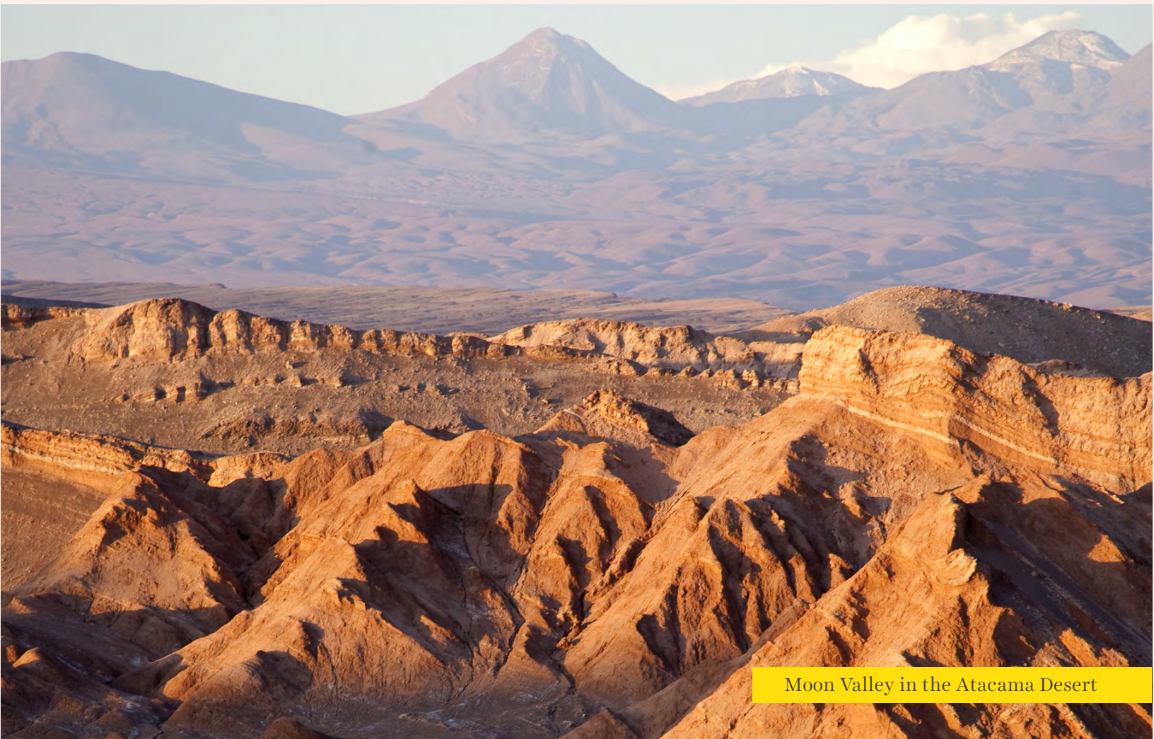
Moon Valley in the Atacama Desert